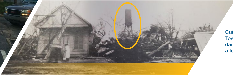
Cuthbert Water Tower after it was damaged during a tornado in 1909