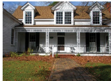
ROSSITER-LITTLE HOUSE Sparta, c. 1779 Considered the oldest houses in Sparta, the Rossiter-Little House was constructed by Dr. Timothy Rossiter. The two front wings were added before the Civil War. The Rossiter-Little House was documented by the Historic American Buildings Survey in the 1930s. Original materials include fireplace mantels, heart pine floors and interior walls of hand cut boards. The two-story house has a kitchen, eight main rooms and two bathrooms. This house has been rehabilitated and is in excellent condition. Comes furnished with period antiques. $140,000.