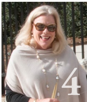
Rhodes Hall Landscape Ribbon Cutting