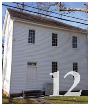
5 Georgia Sites Receive Callahan Incentive Grant