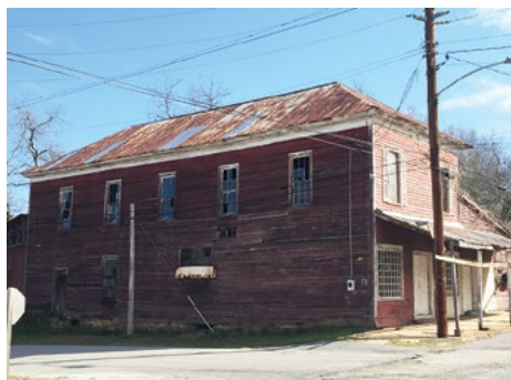
SPARTA FEED AND SEED Sparta, c. 1890s This wood frame commercial building dates to the late nineteenth century and served as Sparta's Feed and Seed. The main building is two-stories with a hipped roof of corrugated metal. A later one-story addition was built on the east side of the building, and a metal pent roof serves as a cover for the building's front entrance. The historic Sparta Feed and Seed building is located one block north of Broad Street, Sparta's main commercial street. Needs substantial rehabilitation. $17,500.