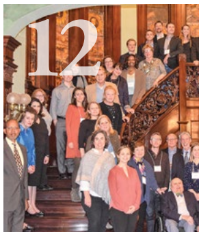
Historic Preservation Leadership Course